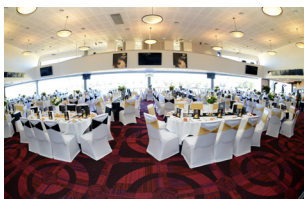
> Temlee Room

It's an undeniable fact that The Meadows Conference & Events Centre is a one of a kind venue. With seven superb spaces, each with their own unique size, aspect, shape, decor and integrated facilities, there's every chance one will be the perfect fit for the event, occasion or engagement you're looking to have hosted. We also offer the ability to use the outdoor grounds as a hire space, should the need be for a larger scale event or activity.