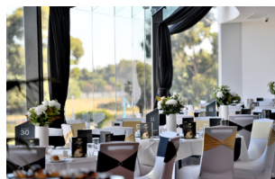
> Temlee West