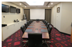
> Board Room