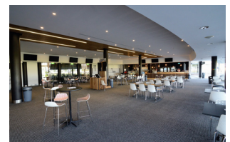
> Midas Room