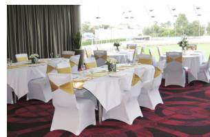
> Temlee East